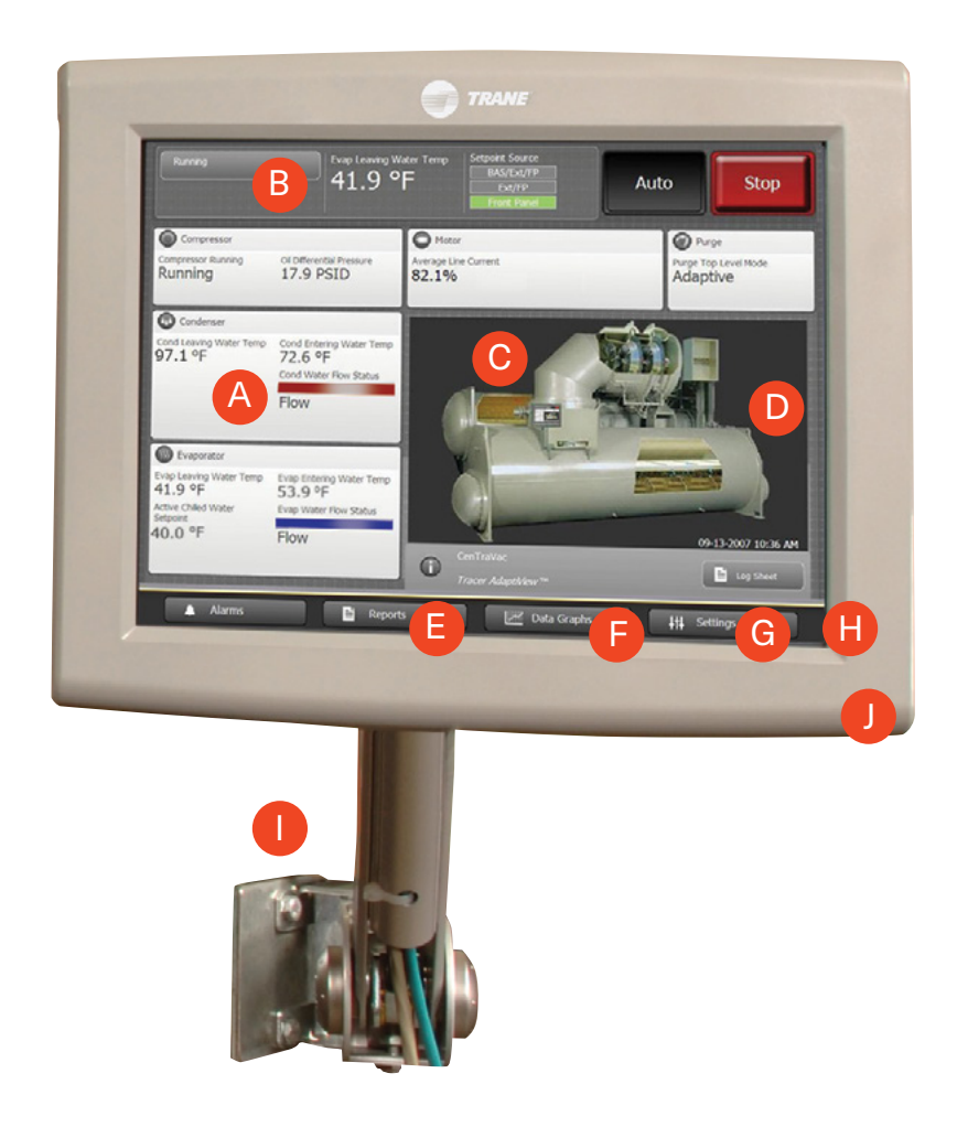
Try it for yourself at www.trane.com/AdaptiViewDemo