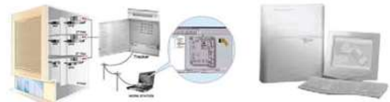
Integrated Comfort System (ICS)