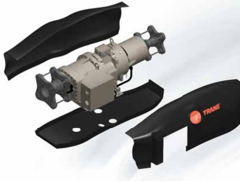
Patented compressor enclosure and metallic bellows absorb vibrations from normal compressor operation.

The InvisiSound Ultimate package also includes a user-selectable noise-reduction mode that can be activated to limit the maximum condenser fan speed, achieving even lower sound levels. This feature allows you to actively manage the unit's operation to comply with nighttime and weekend noise restrictions.