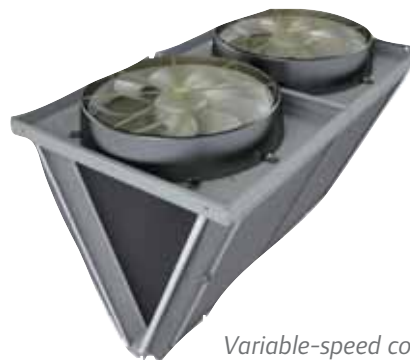
Variable-speed condenser coil fans help reduce sound output.

The key to every Stealth chiller's low sound levels is the combination of variable-speed compressors, variable-speed condenser fans and an integrated compressor muffler. Because variable-speed compressors and condenser fans only operate as fast as demand levels require, their overall sound levels are considerably less during off-peak hours than those of constant-speed units. The integrated compressor muffler reduces sound even more—up to 10 dB when compared to the previous compressor designs.