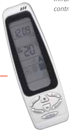
Infrared remote controller RT03

Combining optimum HVAC performance and unobtrusive good looks in the office environment with fast, easy installation, the Trane model CFAS/CFAE one-way cassette units are tailor-made to ensure an unbeatable mix of comfort, low initial cost and ongoing value for money.