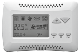
T-MB wall thermostat

Fast, simple to install and commission, low cost remote or wired group control option allows a single user interface to control up to 20 units connected together via an RS485 serial link.